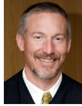
Judge Jon Hulsing