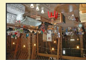
Sale items filled the barn at Eastmanville Farm