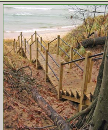
New beach access at Kirk Park

Riley Trails - Improvements include upgrades to the existing parking area and the addition of an entrance sign, trail head kiosk and rustic toilet.